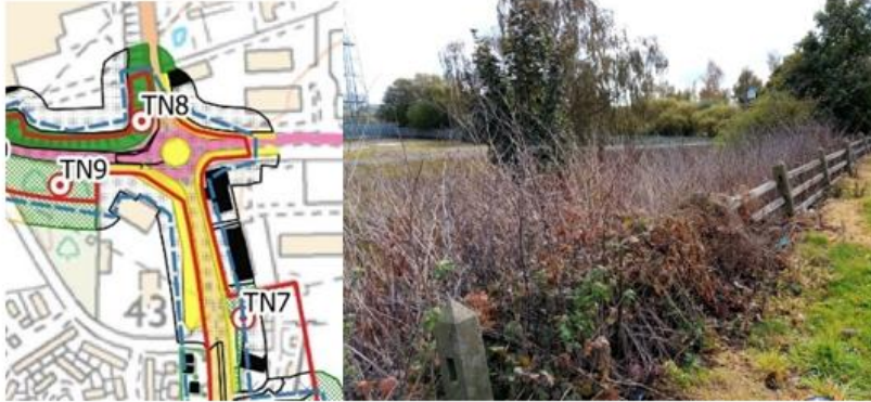
Figure 12: Location (TN7) and photograph of Japanese knotweed within Order Limits